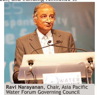
post-2015 development agenda process.

Mass Taal closed the session by emphasizing the need to integrate science and policy to create a coherent message on WASH to input into the