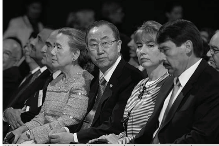
UN Secretary General Ban Ki-moon and other guests during the opening ceremony

Freshwater is a finite resource that is imperative for sustainable development, economic growth, political and social stability, human and ecosystem health, and poverty eradication.