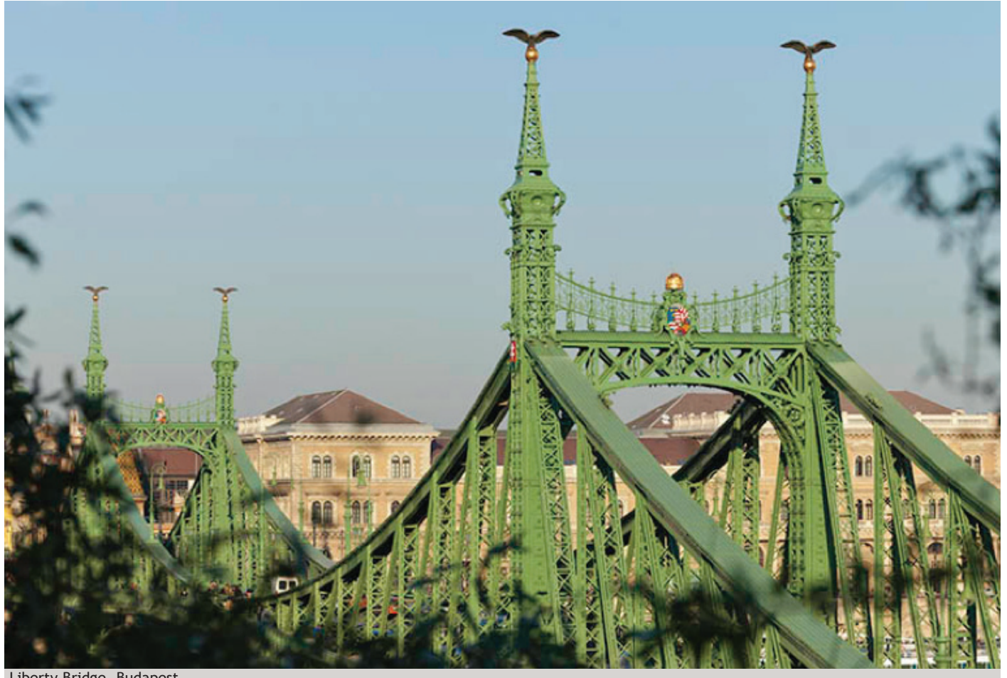
Liberty Bridge, Budapest

Seventh Session of the OWG on SDGs: OWG-7 will focus on sustainable cities and human settlements, sustainable transport, sustainable consumption and production