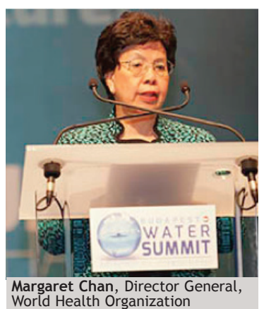
world neatth Organization

disciplinary approaches, saying the health sector alone cannot improve WASH services. She lamented that the limited political power of women means some of the most powerful advocates for WASH have no voice, and said improving WASH would be a "pro-poor strategy on a grand scale." She concluded that prevention is the heart of public health, equity its soul, and access to WASH the lifeblood of good health for all.